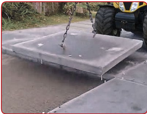
Placing the plates

Legioplate® have short lead times. The plates can be placed directly from the delivery trucks. This allows you the possibility to have a floor structure in only a matter of hours. After soil preparation the plates can be used immediately.